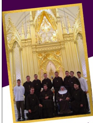
Family Holy hour led by the Knights of the Holy Eucharist