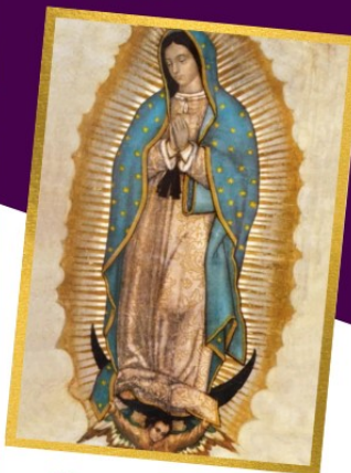
Honor our Blessed Mother on the Feast of Our Lady of Guadalupe